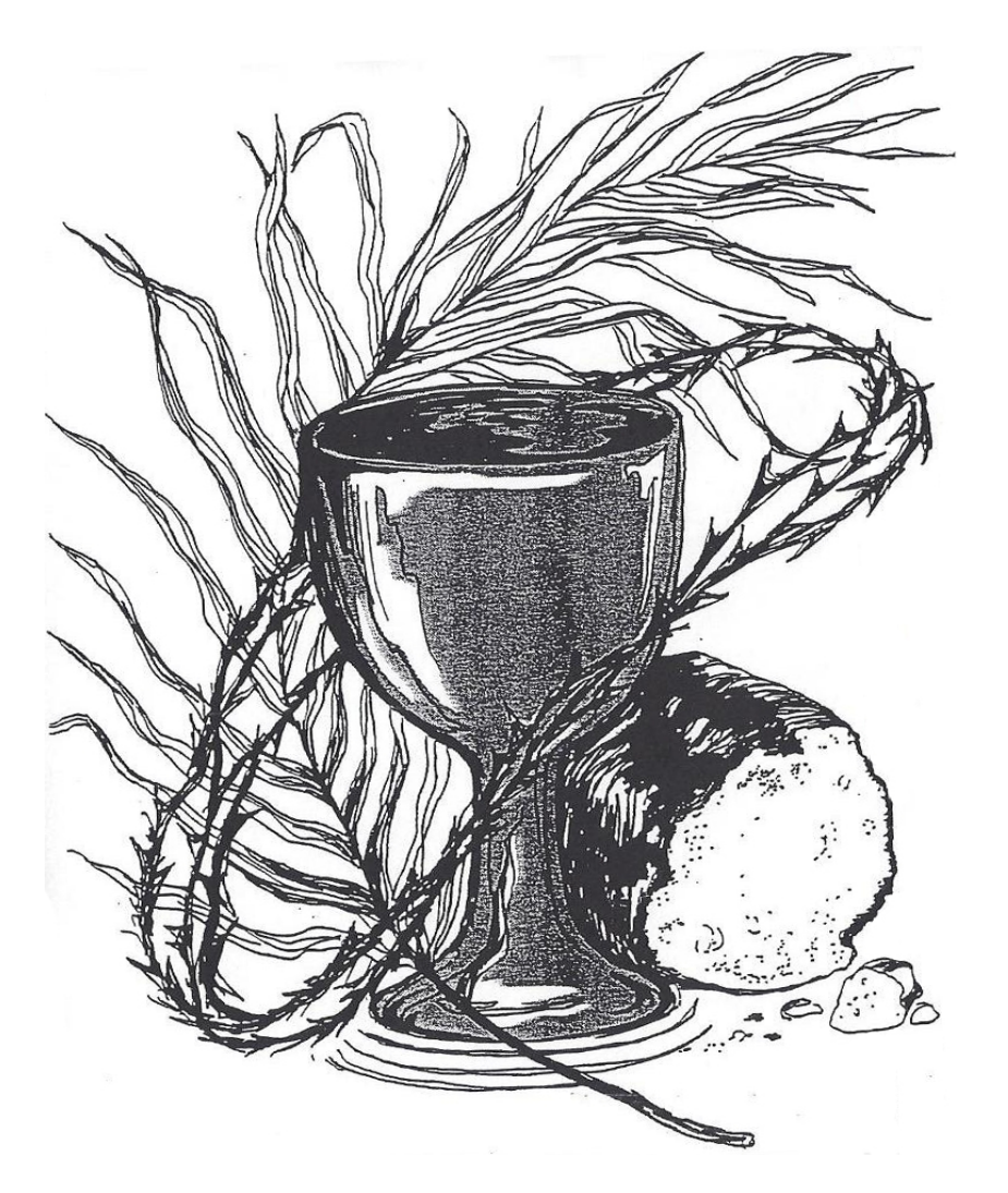
Called by God to be the heart, voice, hands and feet of Christ where the Spirit leads us.