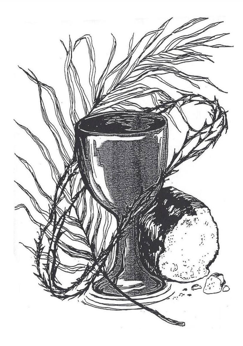
Called by God to be the heart, voice, hands and feet of Christ where the Spirit leads us.