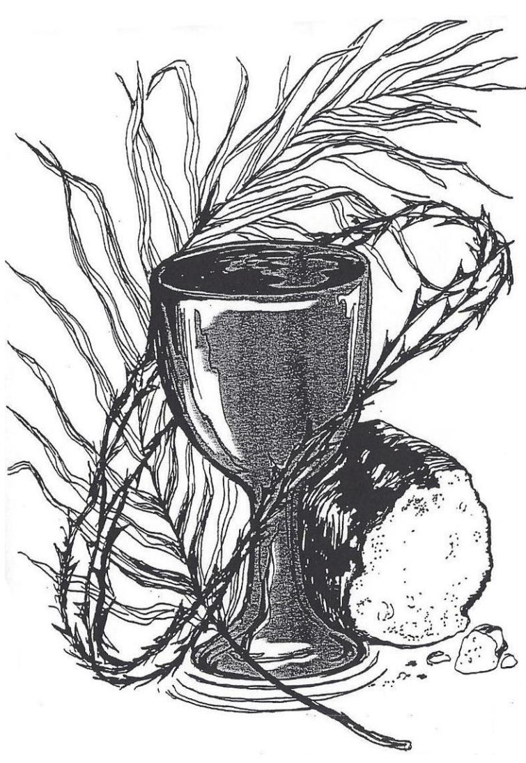
Called by God to be the heart, voice, hands and feet of Christ where the Spirit leads us.