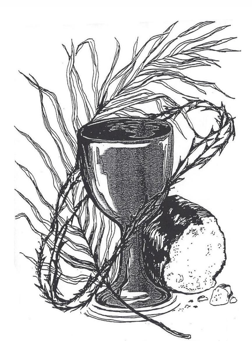
Called by God to be the heart, voice, hands and feet of Christ where the Spirit leads us.