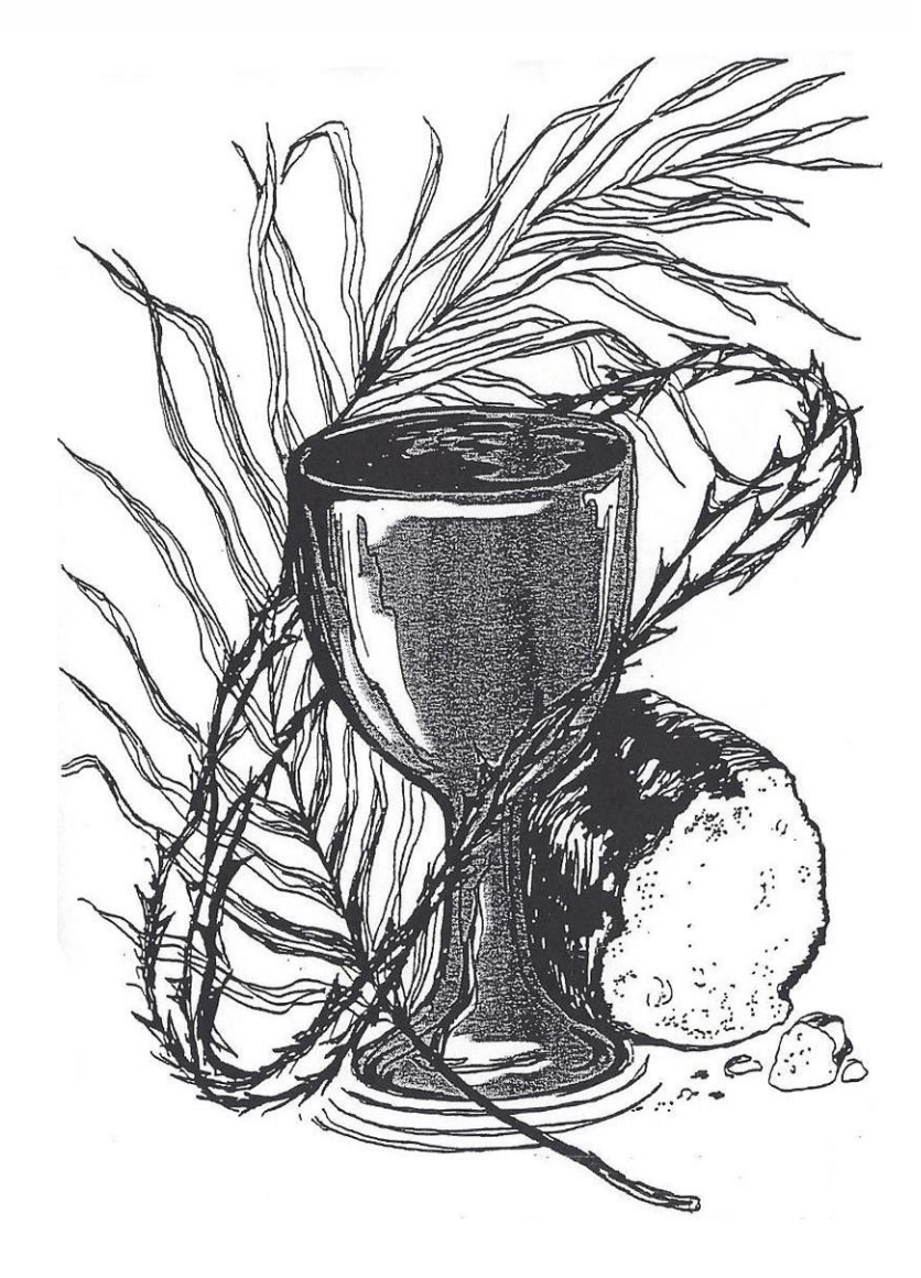
Called by God to be the heart, voice, hands and feet of Christ where the Spirit leads us.